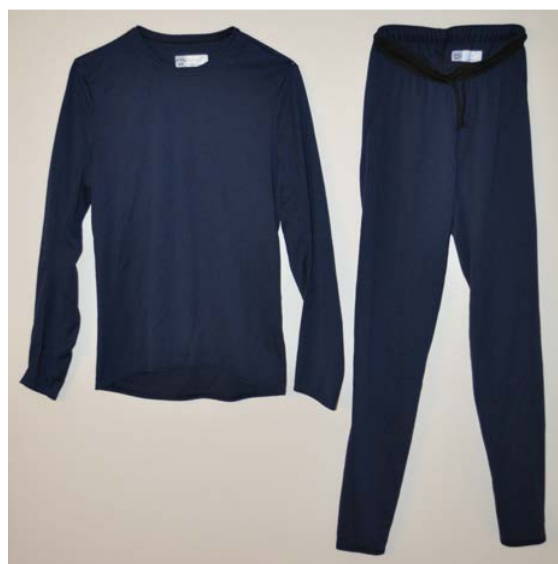
Fig. 1. Photograph of the test apparel.

In general, the data collection sessions comprised a subject who cycled on a cycle ergometer at a constant cadence while the workload was increased every two minutes. During this exercise test, oxygen consumption data were continuously collected by using a TrueMax 2400 metabolic cart (ParvoMedics, Salt Lake City, USA), and blood samples were drawn from a fingertip every two minutes to measure blood lactate concentration with a Lactate Pro analyzer (Arkray Inc., Kyoto, Japan). Each subject completed four test sessions (two per apparel test condition), with each session being at least 48 hours apart. The subjects were instructed to refrain from any behavior outside of their normal physical activity, diet, and sleeping patterns during their entire testing period.